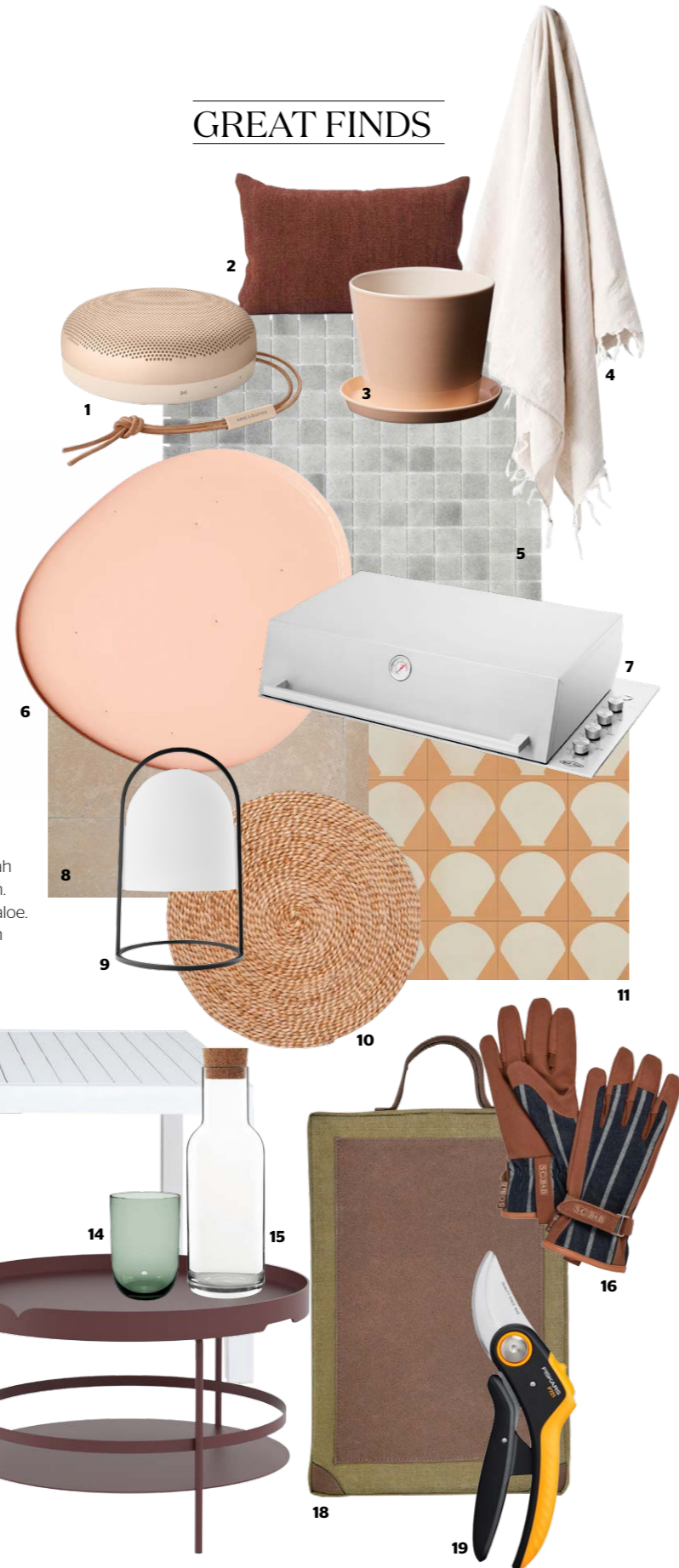
1 Bang & Olufsen 'Beosound A1' portable bluetooth speaker in Gold, $600, David Jones. 2 Città heavy linen jute cushion in Plum, $97, RJ Living. 3 Anne Black Design flowerpot in Cream, $59, Hardtofind. 4 Vintage linen throw in Sand, $169, Aura Home. 5 Hisbalit Mosaico '366A' Spanish glass pool tiles, POA, Artisan Exterior. 6 Low-sheen exterior paint in Dawn Patrol, $109 per 4L, Tint. 7 Beefeater Signature 'ProLine 6B' built-in barbecue with hood, $3799, Harvey Norman. 8 Kahvi limestone pavers in Natural, POA, Artisan Exterior. 9 Eva Solo 'Solar' lantern, $450, Hardtofind. 10 Country Road 'Teer' placemat, $29.95, David Jones. 11 Sarah Ellison 'Beach Club Scallop' encaustic tiles, POA, Teranova. 12 Gather Round 'Kos' extendable table, $899, Temple & Webster. 13 Granada 'Scoop' dining chair in Chalk/White, $775, GlobeWest. 14 Villeroy & Bosch 'Longdrink' glass tumbler in Sage, $34.95 for two, David Jones. 15 Luigi Bormioli 'Sublime' carafe with cork, $49.95, David Jones. 16 Country Style gardening gloves, $63.50, Hardtofind. 17 Lily Tray powdercoated-metal coffee table in Burgundy Clay Textured, $1589, Tait. 18 Canvas kneeler, $107.50, Hardtofind. 19 Fiskars X-series L Bypass pruner, $69, Bunnings.