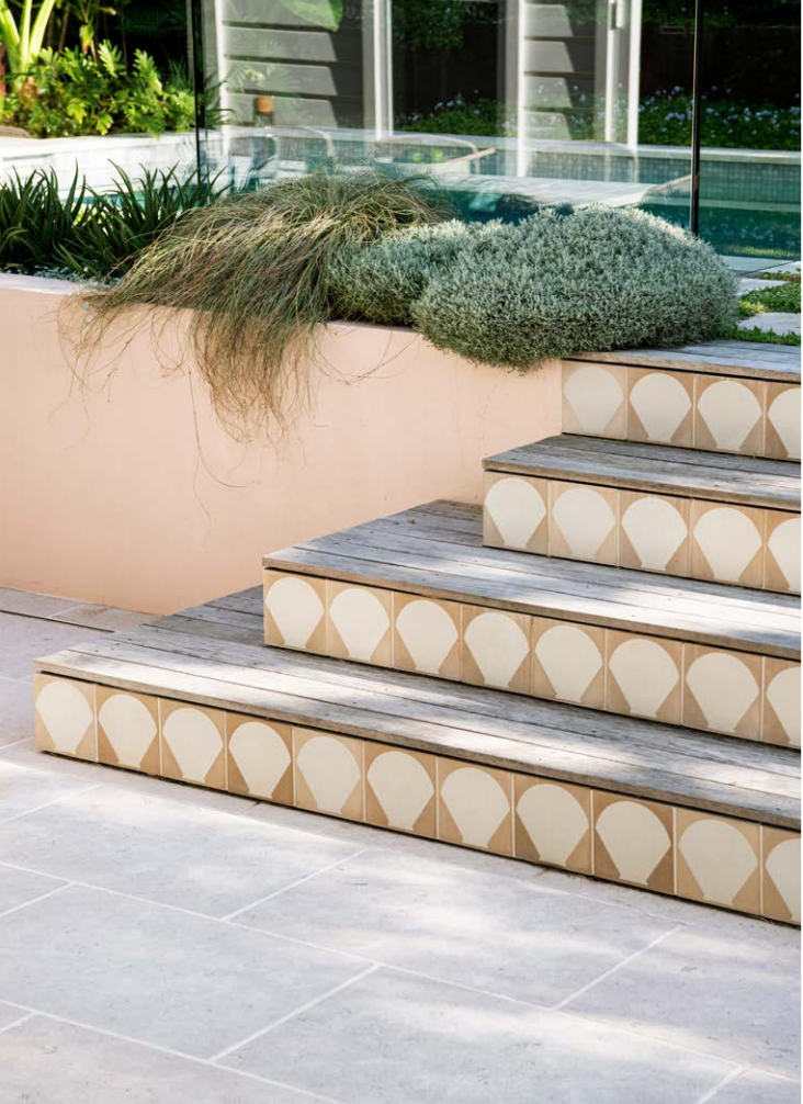
THIS PAGE More Kahvi limestone pavers from Artisan Exterior and Sarah Ellison 'Beach Club' tiles from Teranova. Steps in weathered spotted gum. In the bed are cotton lavender, New Zealand hair sedge and bush baby aloe. OPPOSITE The humungous day bed fronted in weathered spotted gum is big enough to seat the whole family. Lily metal side table, Tait.