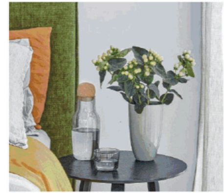
From page 15

fancy or expensive but it does have to be beautiful and comfortable.