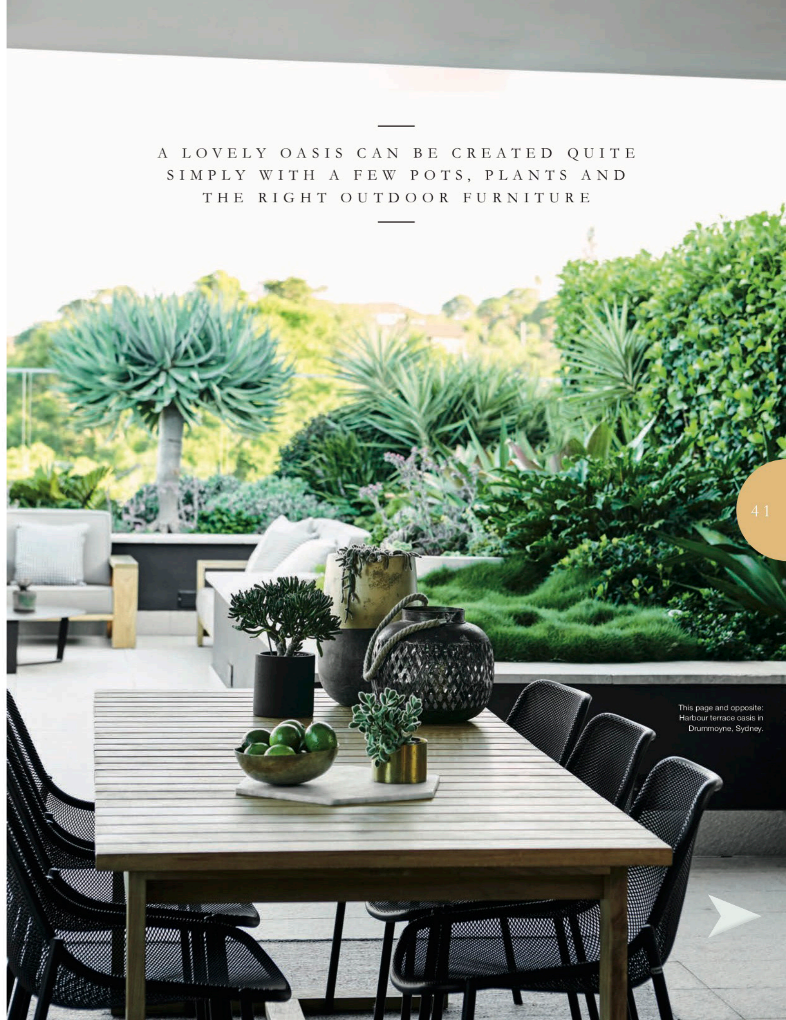
This page and opposite: Harbour terrace oasis in Drummoyne, Sydney.