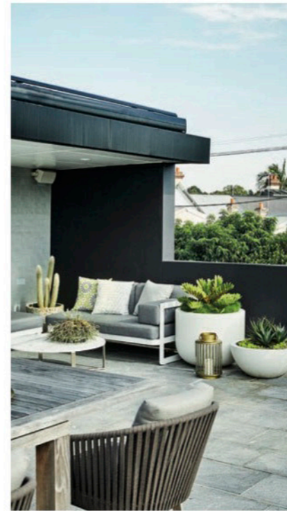
Modern rooftop terrace in Leichardt, Sydney.