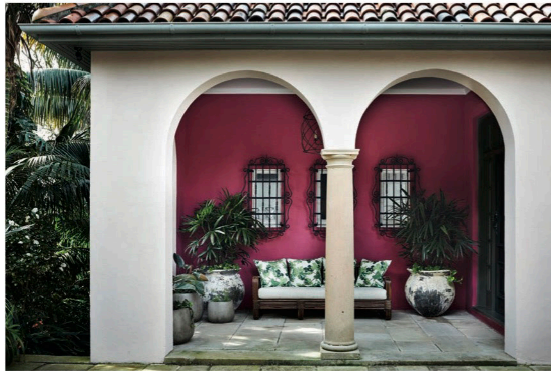
Cosy garden apartment terrace in Bellevue Hill, Sydney.