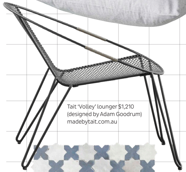
Tait 'Volley' lounge $1,210 (designed by Adam Goodrum) madebytait.com.au