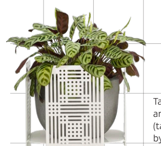
Tait 'Terrace' table $605 and 'Terrace' plant stand (tall) $506 (both designed by bernabeifreeman) madebytait.com.au