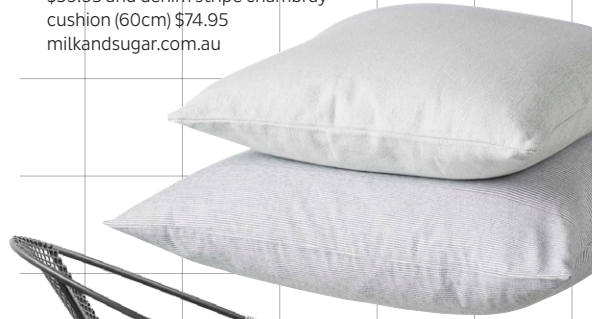
Milk & Sugar silver woven cushion (50cm) $59.95 and denim stripe chambray cushion (60cm) $74.95 milkandsugar.com.au

Native to Japan, this hardy plant tolerates very dry conditions and makes an excellent ground cover.