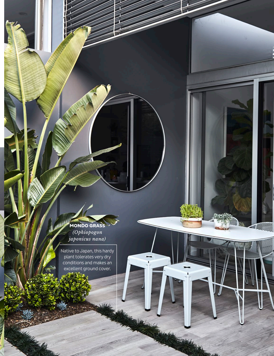
MONDO GRASS ( Ophiopogon japonicus nana )

Native to Japan, this hardy plant tolerates very dry conditions and makes an excellent ground cover.