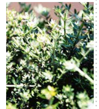
Westringia (coastal rosemary) is a native evergreen shrub. It's both salt tolerant and low maintenance.