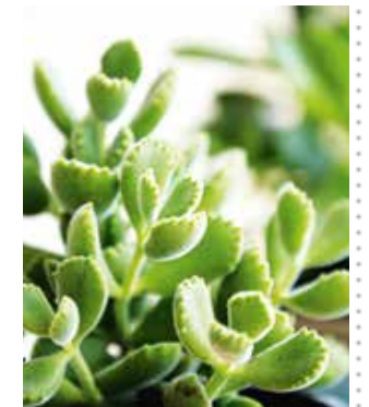
Cotyledon ladismithiensis (bear's paws) are a sculptural succulent, suitable for both indoors and out.