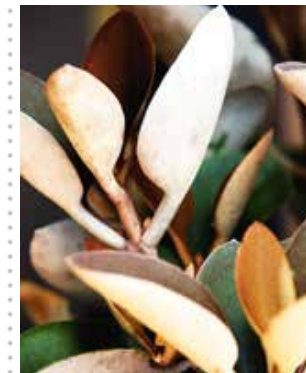
Kalanchoe orgyalis (copper spoons) grows into a small shrub, adding height to plant displays.