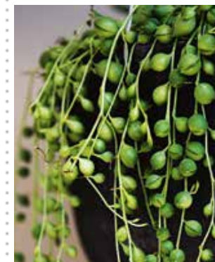
Senecio rowleyanus (string of pearls) has trailing 'beads' that look great in a hanging planter.