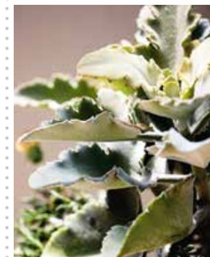
Kalanchoe beharensis (elephant's ear) has velvety leaves and grows into a small, tree-like shrub.